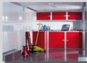
Stylish and functional aluminum cabinetry is crafted at Pace and can be custom configured for your exact needs.