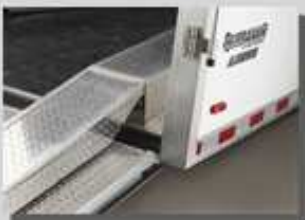
This ramp over wheel well is a nice, convenient option for car haulers.