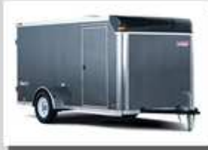
Smaller single-axle trailers are easy to hitch, tow and maintain.