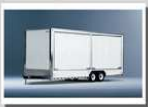
Concession, vending and game trailers are a Pace specialty.