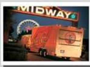
Pace is North America's number one trailer brand.