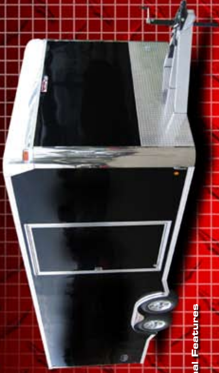
Trailers Shown with Optional Features

"Quality is a Standard... Not an Option"