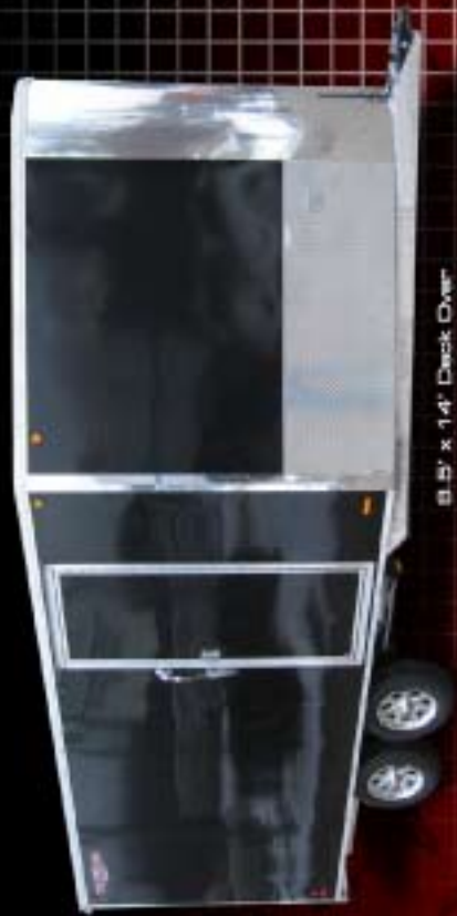
8.5' x 14' Deck Over