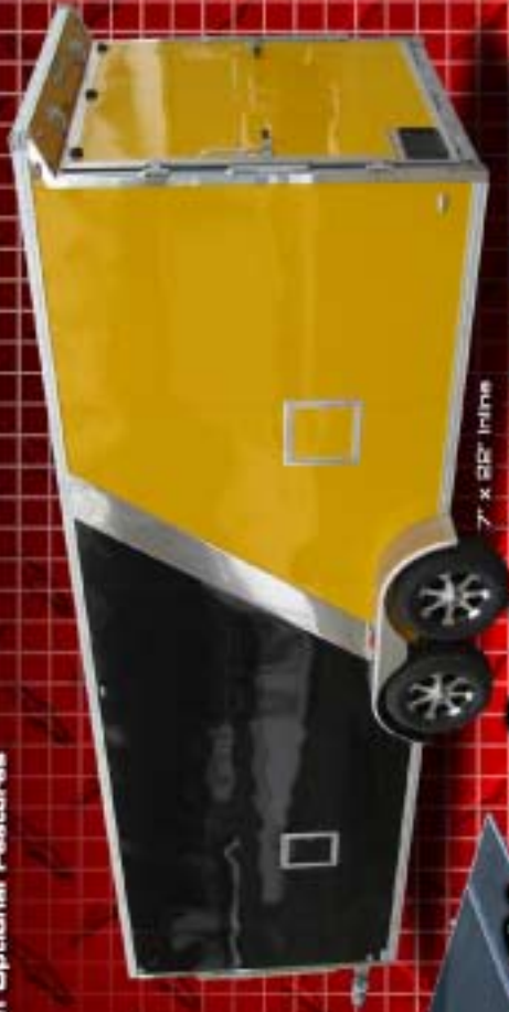
7' x 22' In-Line

"Quality is a standard... Not an Option"