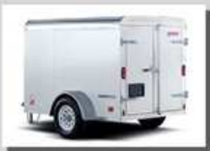
Single axle model shown.