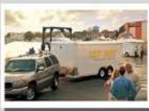
Pace CargoSport trailers look great and project your professional image.