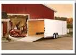
Race car and automobile transporters are a Pace specialty.