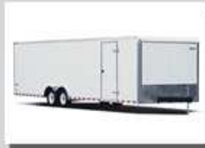
Pace American trailers are designed and built to last.